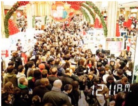
Macy's Herald Square in New York